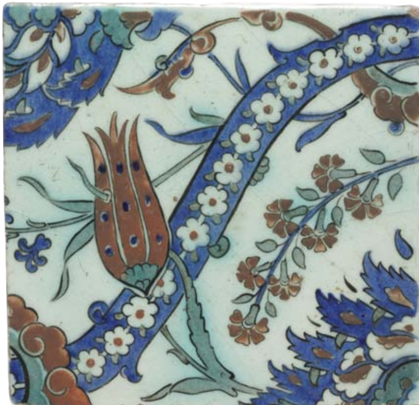
Tile with Carnations and Tulips , late 1500s. Turkey, Iznik? Rhodian ware. Glazed earthenware; Diameter: 17.8 cm. Educational Purchase Fund 1921.107

For a completely different approach to tilework, compare this to the Mihrab (1962.23), made with small pieces of cut tile to create elaborate patterns, at the entrance to gallery 116.