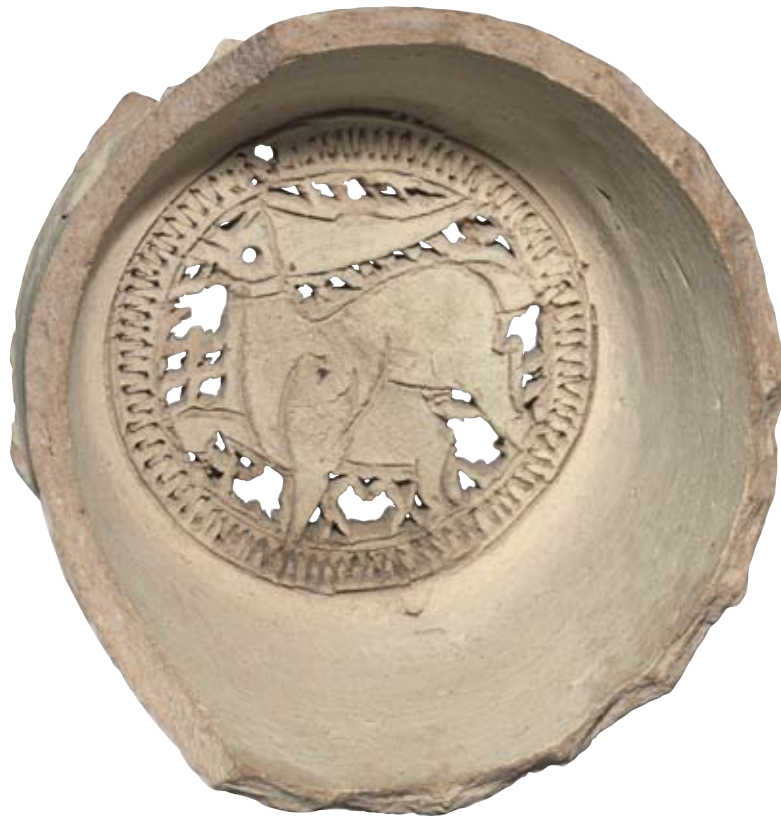
Fragment from a Water Jar, 1100s. Egypt, Fustat. Un- glazed ceramic; 7 x 7 x 4.5 cm. Educational Purchase Fund 1924.799

This was made in Fustat, the early capital of Egypt (Cairo became the capital in 969). Fustat was a major trading center at the time. Now there is very little left in the deserted city a few miles outside Cairo. Many ceramic fragments were excavated in Fustat, testifying to its importance as a center of ceramic production as well.