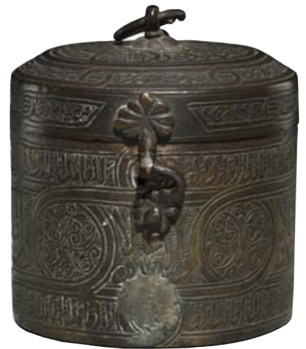
Inkwell , 1400s–1500s. Iran. Brass; 10.8 x 9.5 cm. Gift of the John Huntington Art and Polytechnic Trust 1915.598

The richly decorated surface shows that even humbler metals were given much artistic attention. This was partly out of necessity—Islam suggests people should reject excessive wealth to promote a simpler life. This inkwell has some very general stylistic similarities to the Wade Cup (1948.485) in that the brass vessel's surface lends itself to inlay with silver or gold, even though this particular inkwell shows no signs of ever being inlaid.