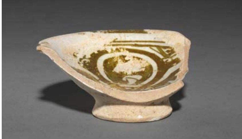
Fragment of a Bowl, 900s–1000s. Egypt, Fustat. Hispano-Moresque ware. Glazed ceramic; 3.8 x 10.2 x 8 cm. Educational Purchase Fund 1924.783

This ceramic fragment features decoration in shiny gold, achieved through a process called lusterware, where metallic oxides are painted on before a second firing, which then adhere to the surface of the clay body as a shiny film. This two-step process—a true technological innovation in its day—was done to make a humbler material appear more opulent. It is said that necessity is the mother of invention; this fragment reflects the need of Muslim artists to respect their faith’s mandate of humility by specifically choosing lesser metals and materials. Notice too that the clay body (which can be seen on the side of the fragment) is a darker color than the white slip on the surface, which was done to make the rougher clay body appear more refined.